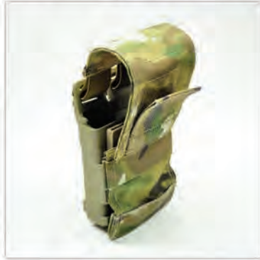
Custom nylon applications mounted to FastMag Heavy (7.62) (or) FastMag (5.56) with MALICE® clips.