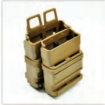
FastMag Heavy (7.62) and FastMag (5.56) double stacked.