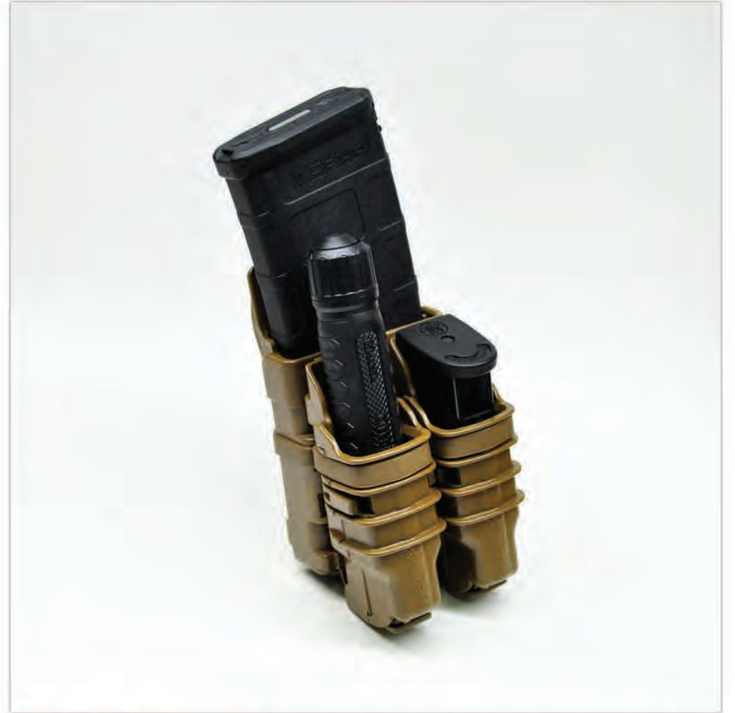
Although the ITW FastMag series is primarily used for holding most 7.62 magazines, 5.56 magazines and single/double stacked pistol magazines, the FastMag can also be used to hold other objects such as flashlights, med kits and other objects that fit its profile.