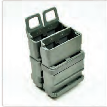
(2) FastMag (5.56) double stacked.