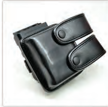
Standard leather LE pistol patrol pouch mounted to FastMag Heavy (7.62) (or) FastMag (5.56) with MALICE® clips.