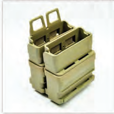
(2) FastMag Heavy (7.62) double stacked.