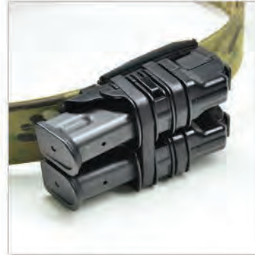
(2) FastMag Pistol on custom horizontal nylon mount for duty belt.