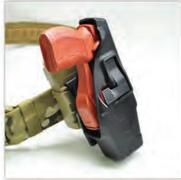
Taser holster mounted to FastMag Heavy (7.62) (or) FastMag (5.56) with MALICE® clips.