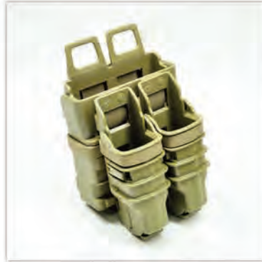
FastMag Heavy (7.62) with (2) FastMag Pistol stacked.