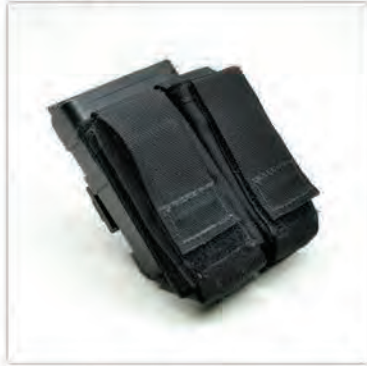
Standard nylon pistol pouch mounted to FastMag Heavy (7.62) (or) FastMag (5.56) with MALICE® clips.