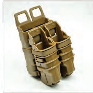
FastMag (5.56) with (2) FastMag Pistol stacked.